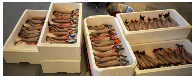
Evaluation of potential blood spots and discolorations on saithe