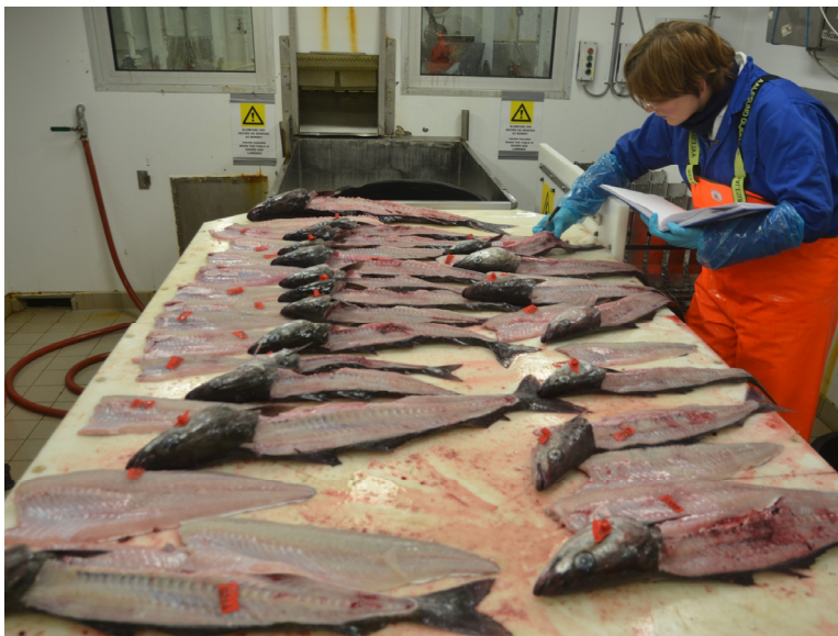
Evaluation of trawl-caught saithe after electrical stunning in air. Polarity: (-) on steel conveyor belt, and (+) on electrodes (flaps)